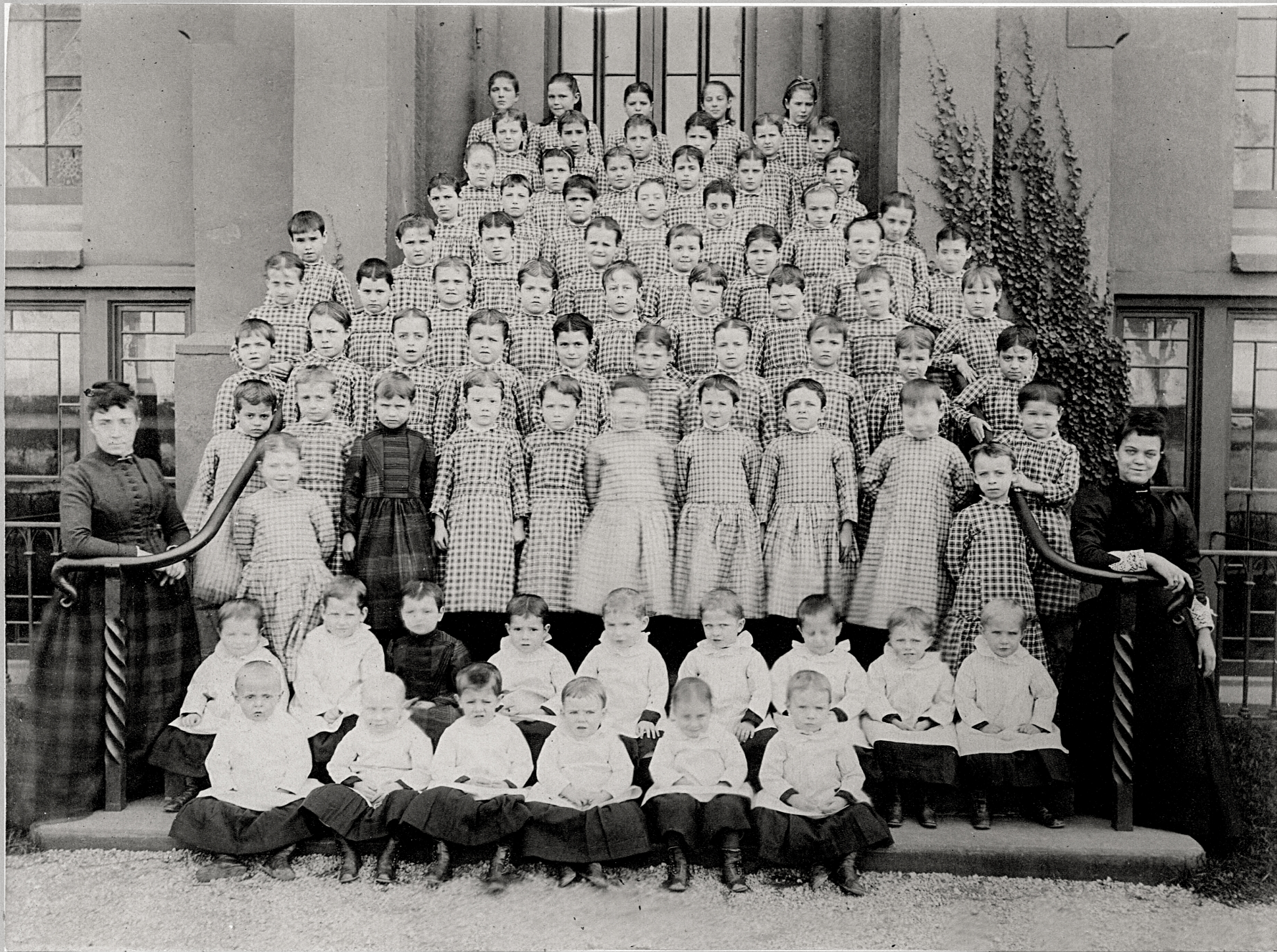
Students of The Central School, posed on the front stairs.